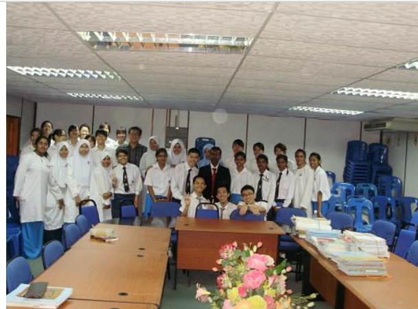
SMK Chua Min, Kulim