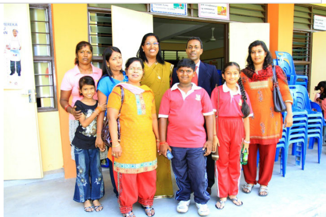
SJK (T) Jawi, Penang