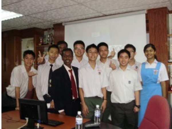
SMK Chua Min, Kulim