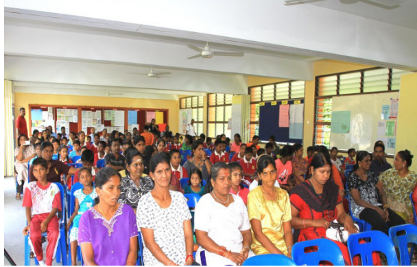
SJK (T) Jawi, Penang