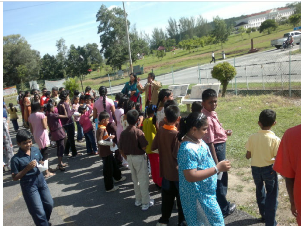
Public Workshop in Kulim