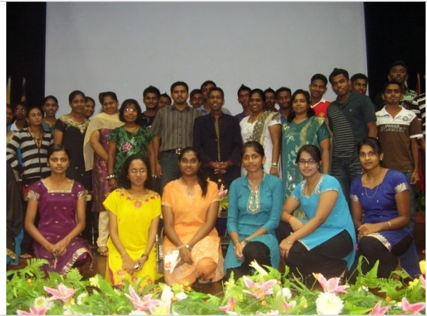
IPL College, Butterworth, Penang