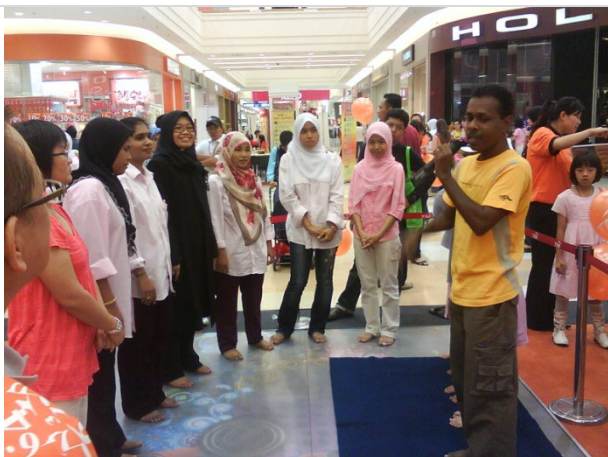
TM in JUSCO Jointly Public Seminar