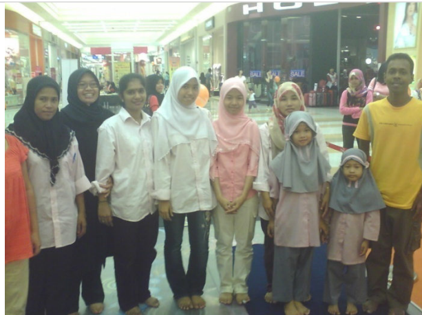
Public in Kajang, Selangor