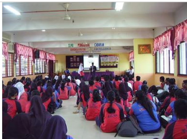
SMK Telok Panglima Garang, Kedah