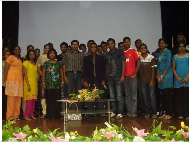
IPL College, Butterworth, Penang