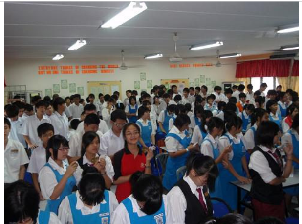
SMK Andalas Klang, Selangor