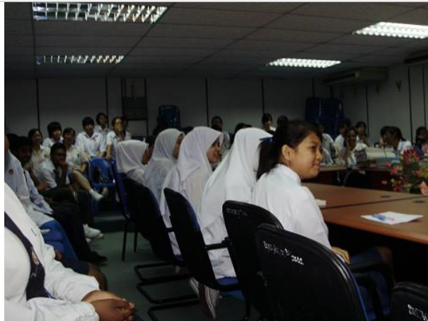
SMK Chua Min, Kulim