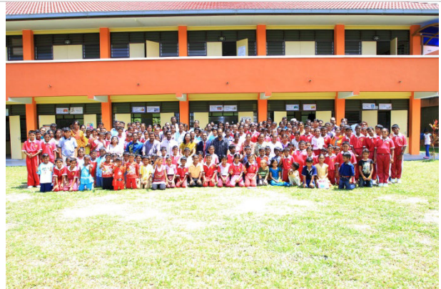
SJK (T) Jawi, Penang