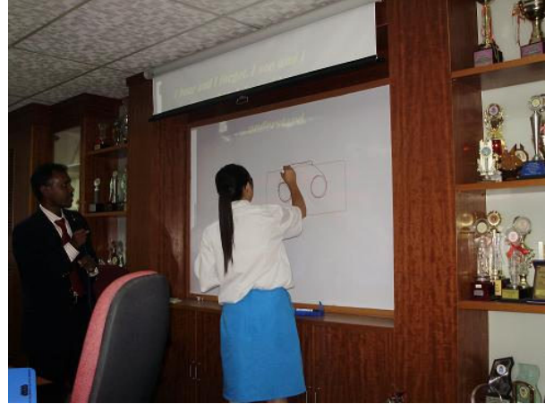
SMK Chua Min, Kulim