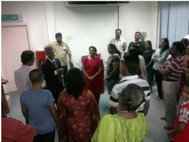
Public, Parents, Kedah