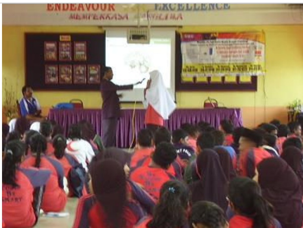
SMK Telok Panglima Garang, Kedah